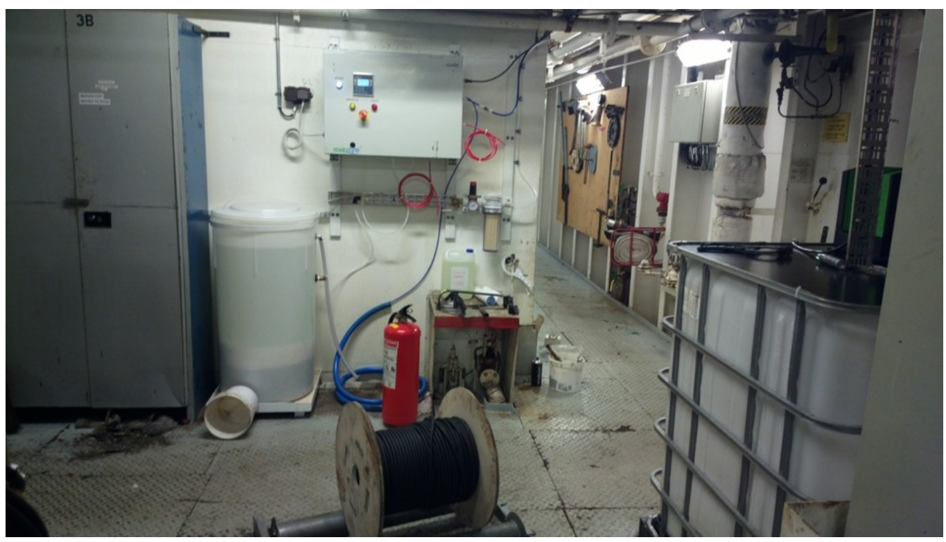
Envirolyte ELA-400 anolyte generator , brine tank, pressure control valve, water filter, pipes and fittings.