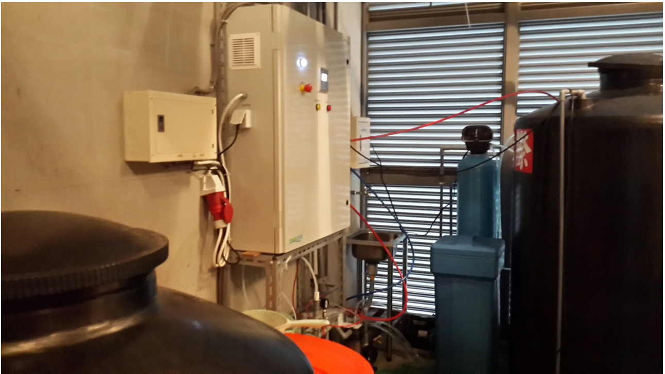
Enviolyte ELA-3000ANW anolyte generator