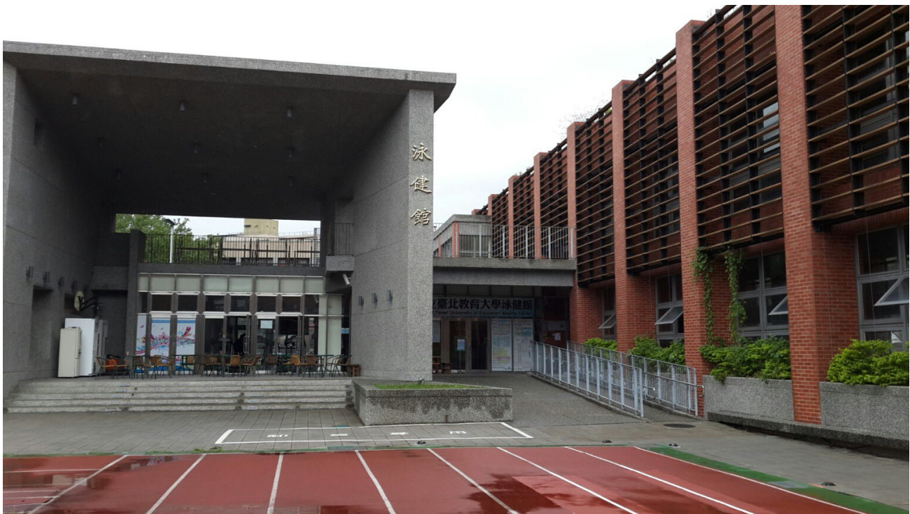
Taipei university and the swimming pool