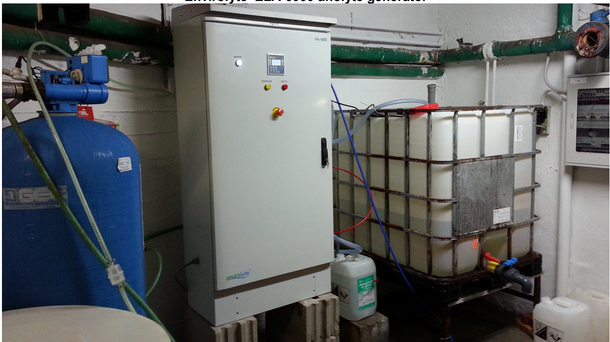
Envirolyte ELA-6000 anolyte generator