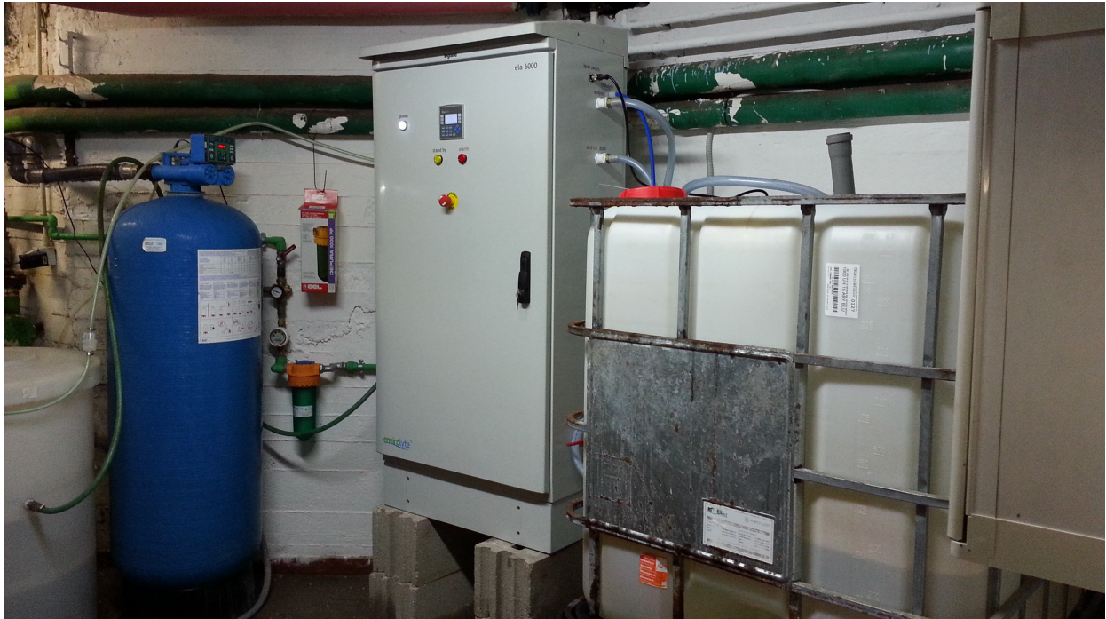
Envirolyte ELA-6000 anolyte generator