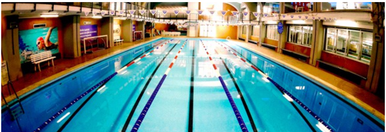
Swimming pool in Athlon sports center

Swimming pool: two pools: 420 m 3 and 100 m 3 , fitness room, weight room, dance floor, ice skating ring, event rooms