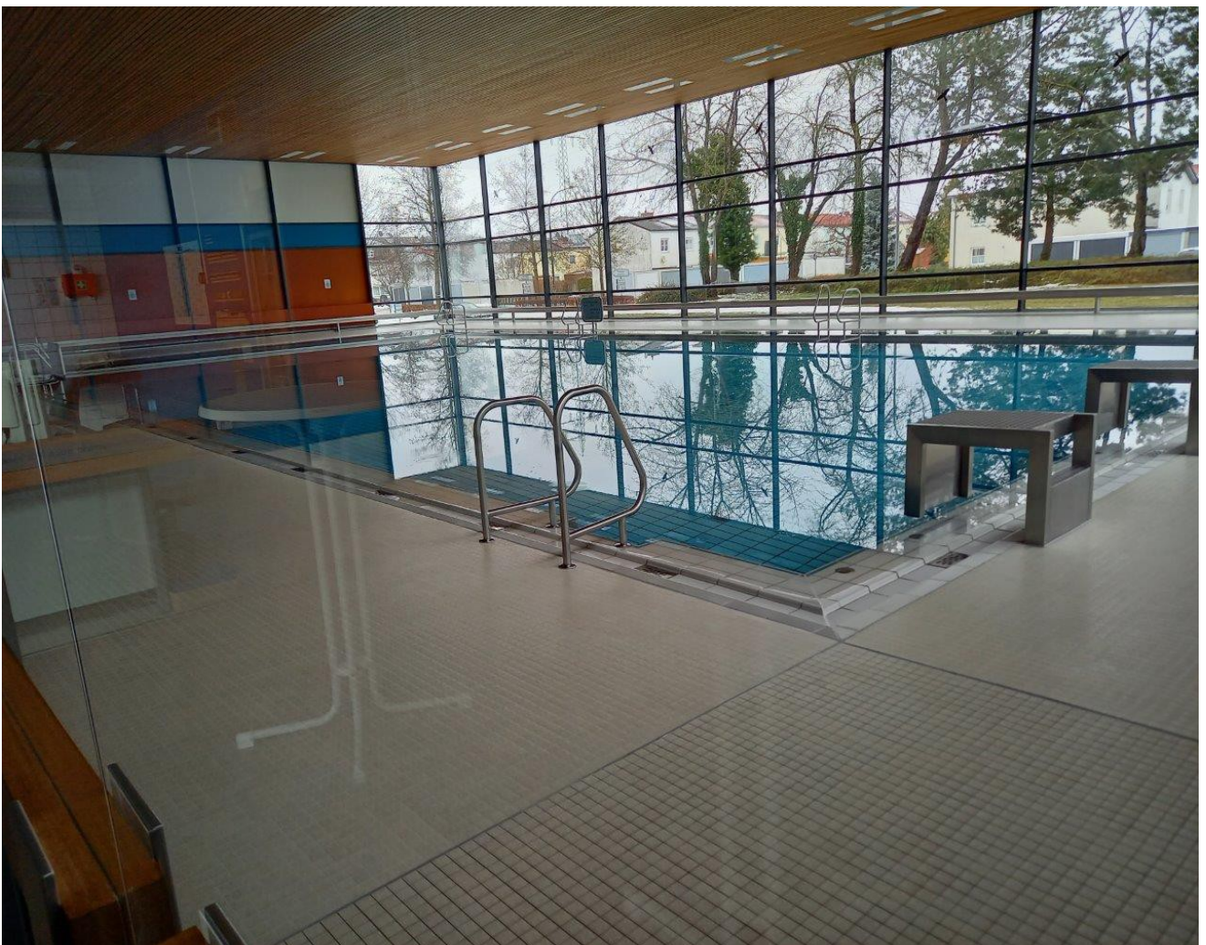
Swimming pool area