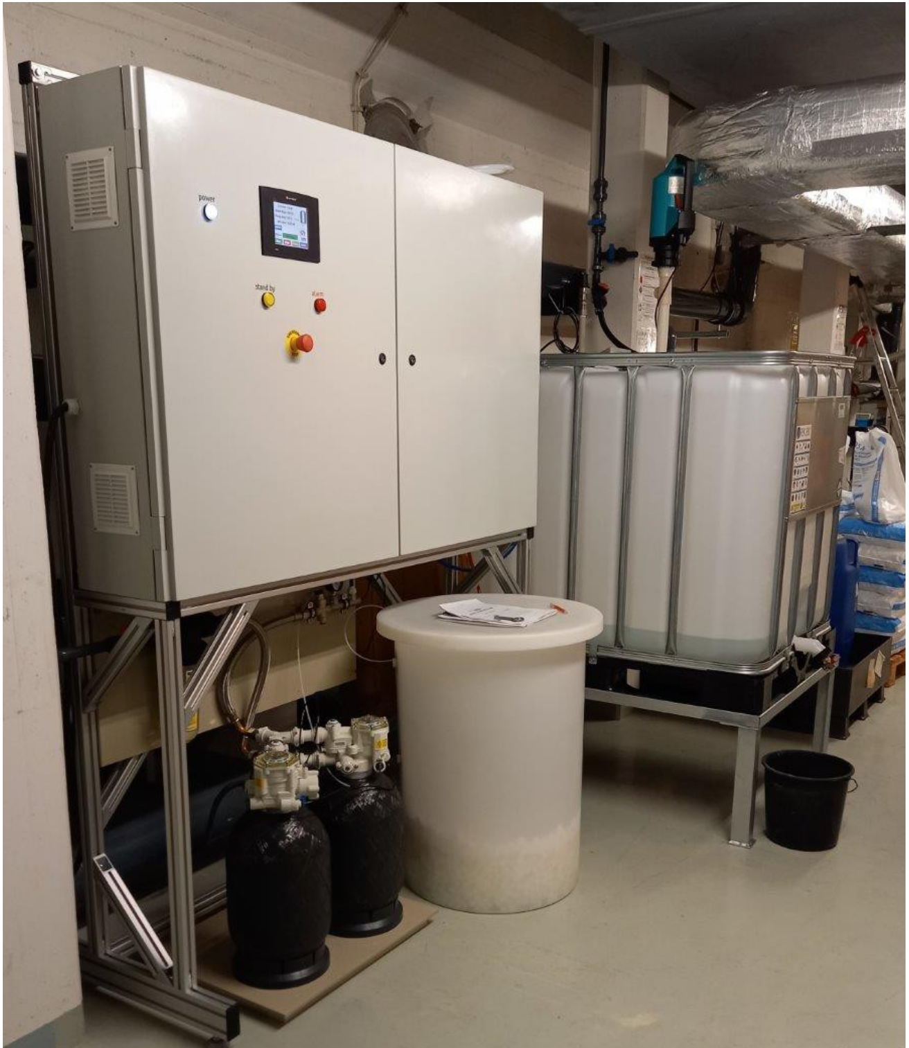
EnvirolYTE ELA-4000 anolyte (HCLO) generator with Ontario Duplex water softener