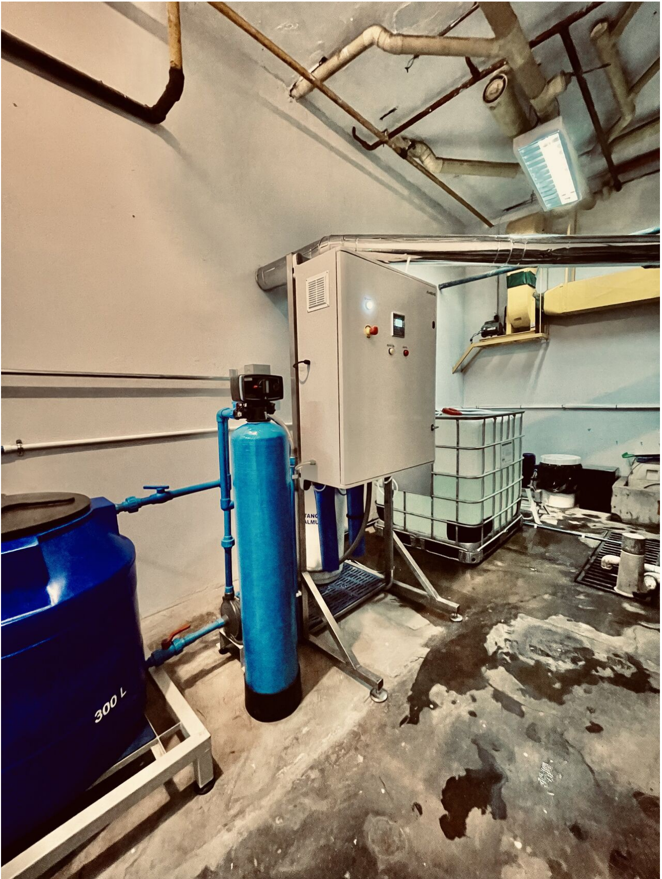
ELA-400HD installation at “Intercontinental Cali” with water softener and anolyte tank