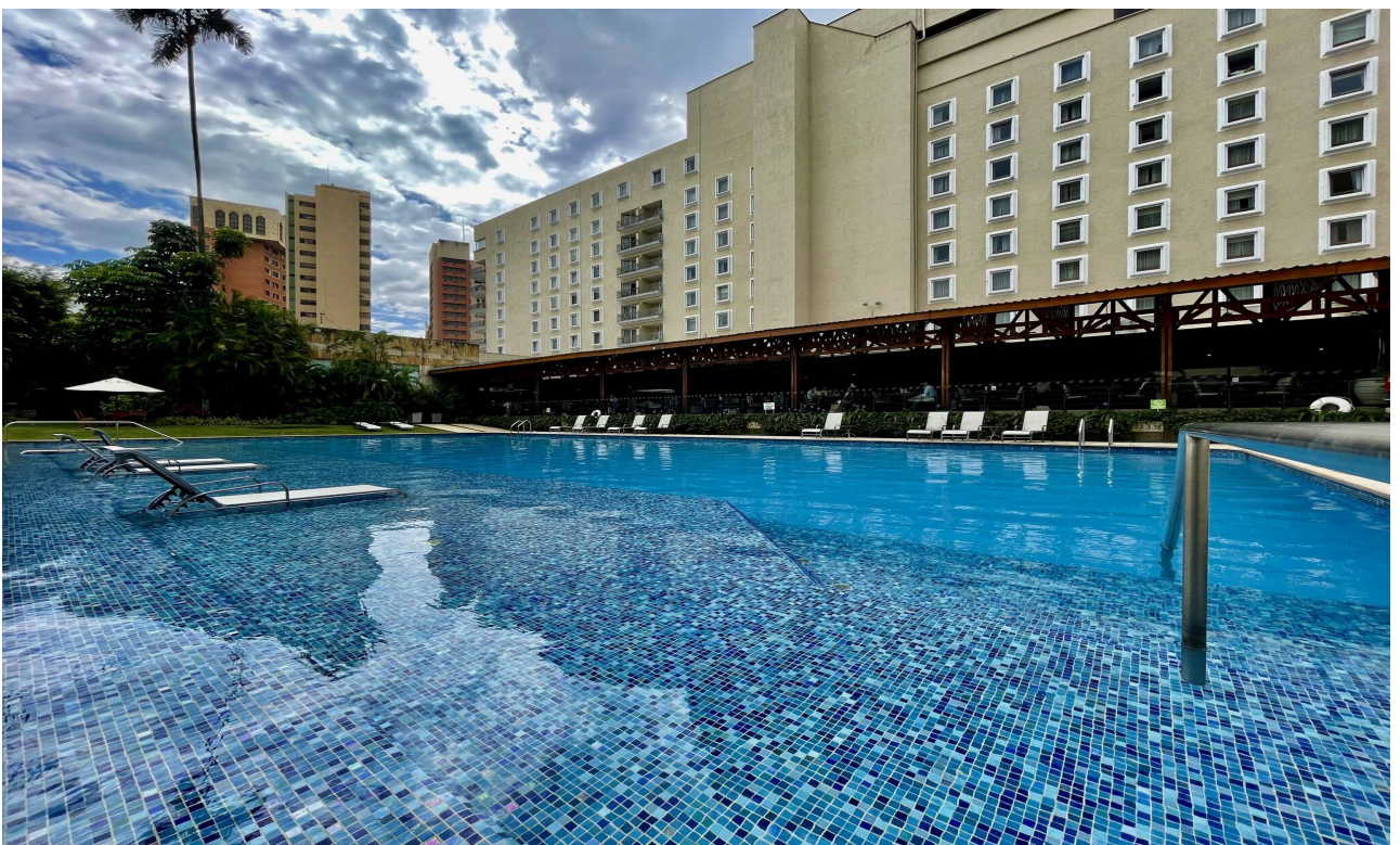
Swimming pool at “Intercontinental Cali”