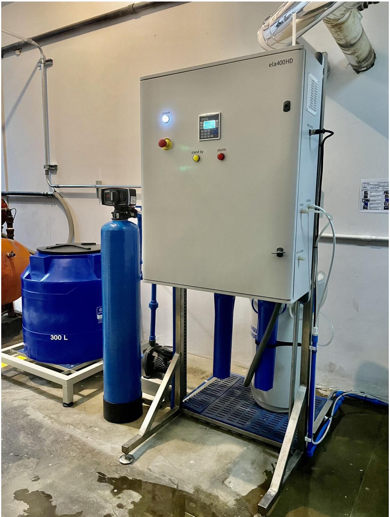
ELA-400HD installation at “Intercontinental Cali”