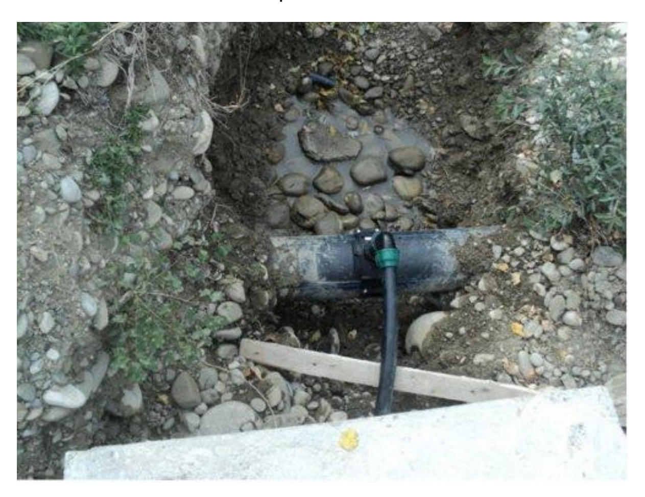
Anolyte injection point