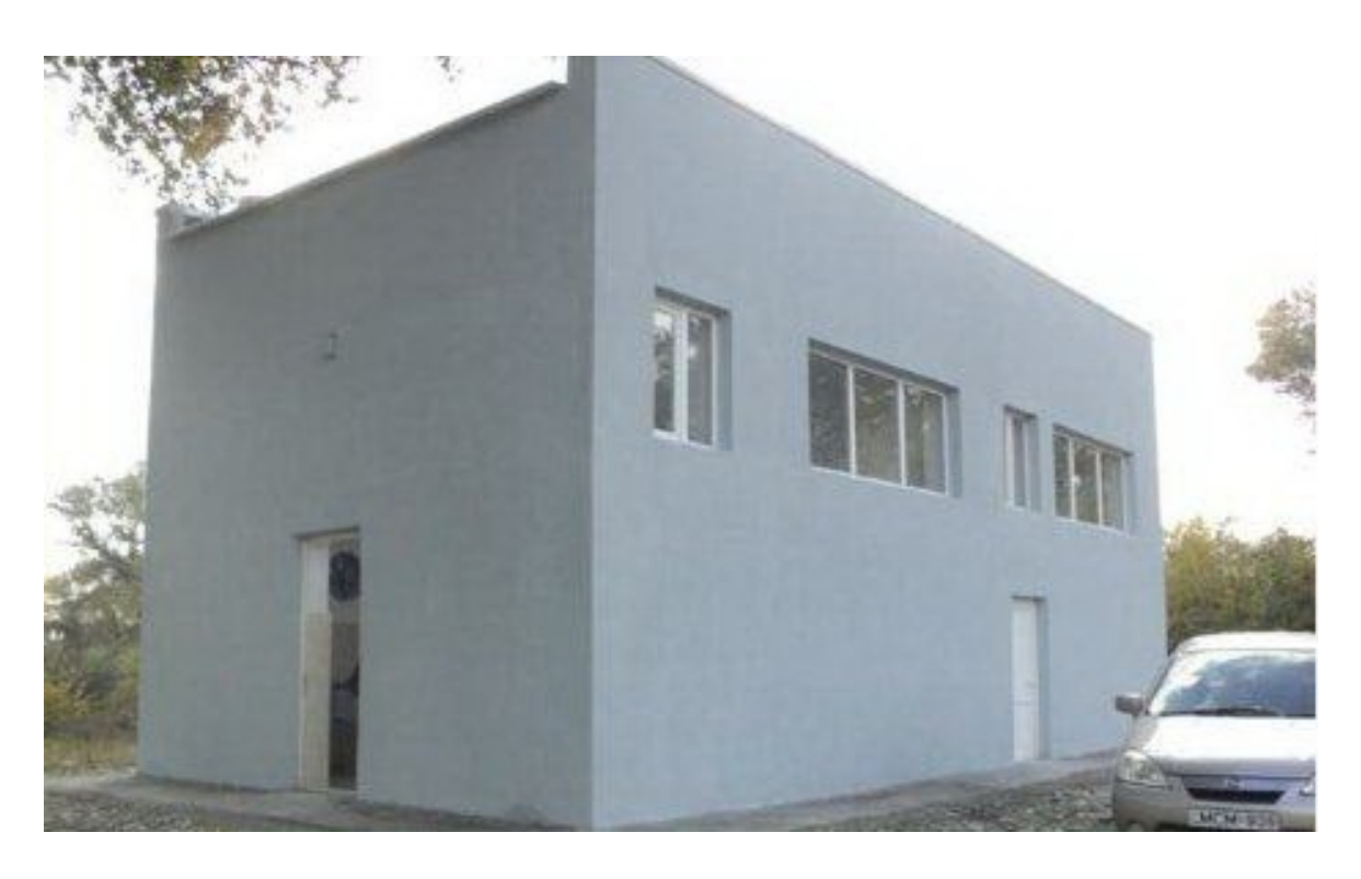
Water purification station