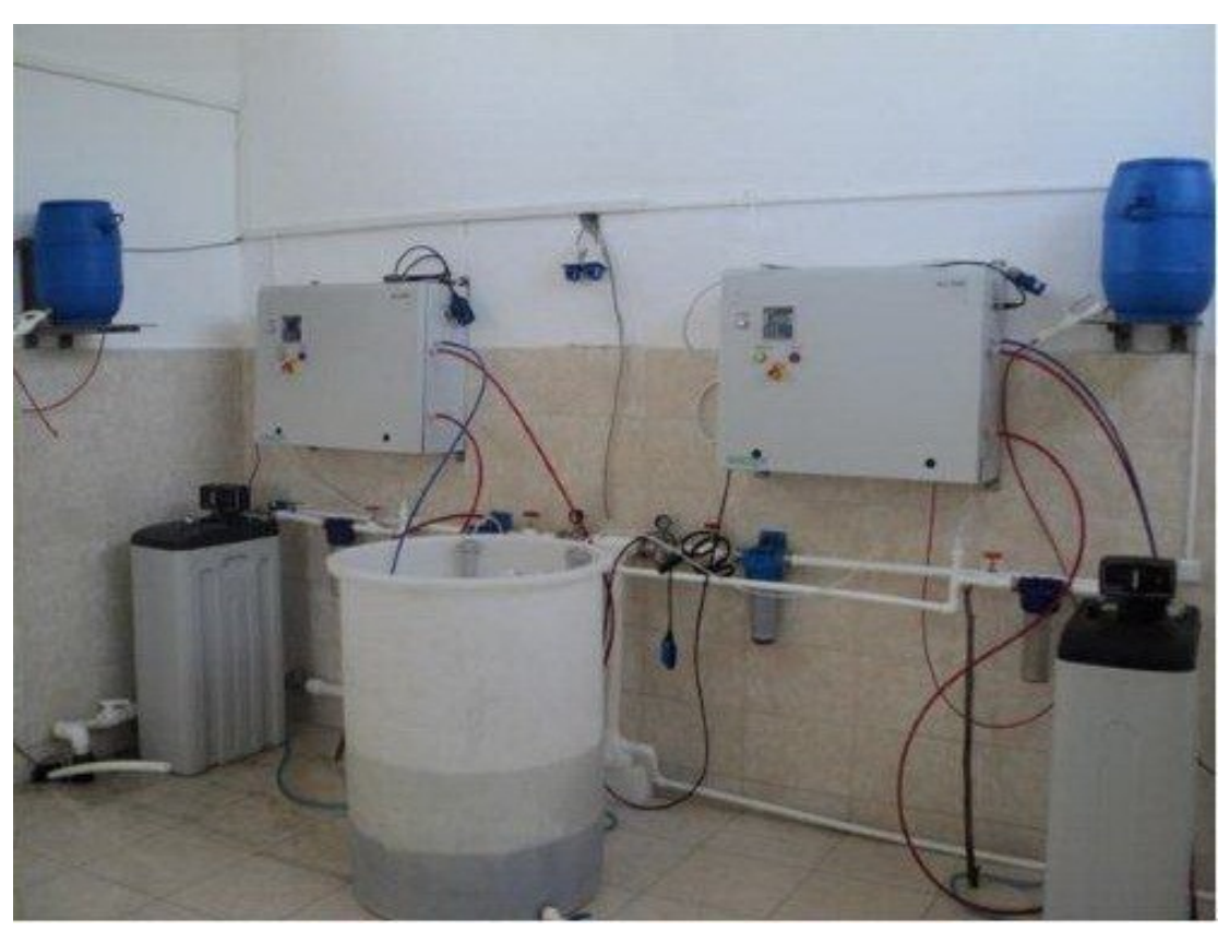
ELA-2000s with brine tanks, water softeners and anolyte tank

It's worth mentioning that after project completion water supply problem will be solved for Sartichala population, therefore project implementation is a very important issue for locals.